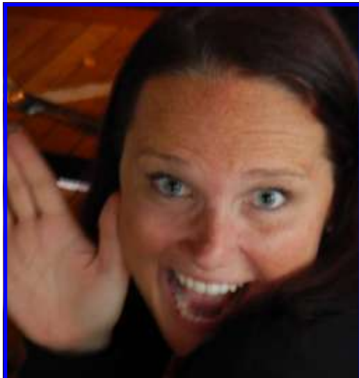
I had a great time! Do you know my name?*

O ur summer Happy Hour at the Yard House in Downtown at the Gardens was well attended by our members. Thank you to everyone who braved the stormy weather to come out and enjoy a fun time!